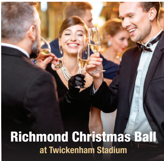
Richmond Christmas Ball at Twickenham Stadium

Awards, Drinks Reception, Dinner and Dancing