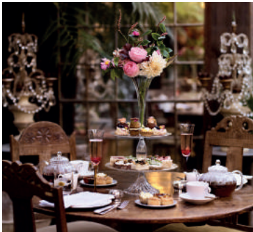
Gift a Garden Afternoon Tea experience

Departing from tradition and set within our greenhouses with a backdrop of the nurseries' wild gardens, our Garden Afternoon Tea is a celebration of nature, with wholesome recipes that reflect the rustic and spirited style of Petersham Nurseries. Perfect for a special occasion or a well-deserved treat, create a lasting memory at Petersham Nurseries.