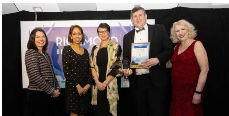
HIGHLY COMMENDED: Butterworth Laboratories and TechDivision COMMENDED: A Sparks Electrical and Super Structures Associates

As a result of the pandemic and recent events the economic climate is very uncertain and Adcock Financial Services are very competently providing an essential service to its clients applying the very highest professional standards to help them through the financial uncertainty to plan for a better future. Many congratulations!