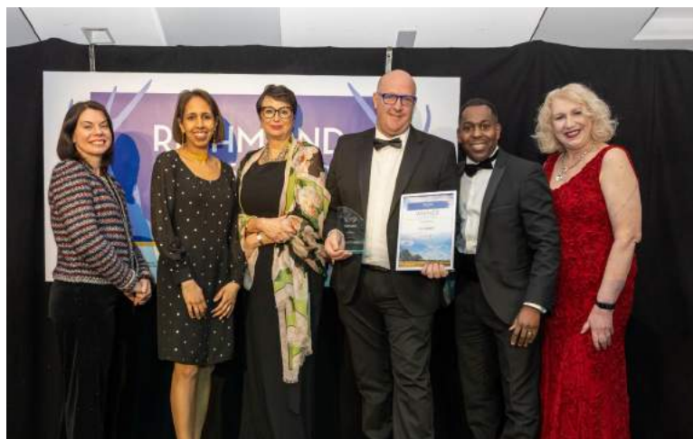
HIGHLY COMMENDED: Pet People COMMENDED: The Fat Badger Restaurant and Farm Shop